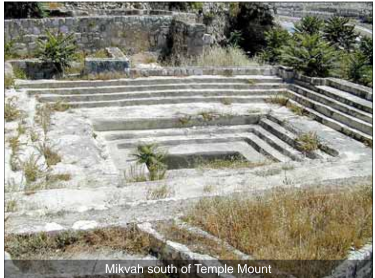
Mikvah south of Temple Mount