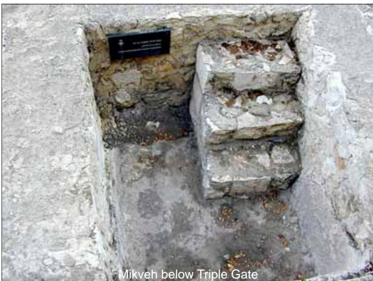
Mikveh below Triple Gate