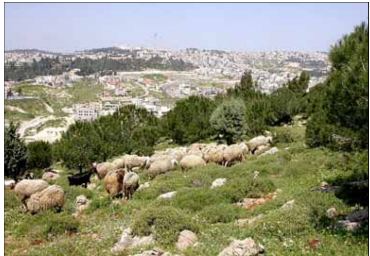
Sheep grazing near Nazareth